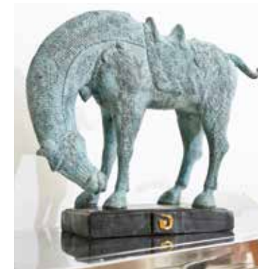
Top: Words are a common design feature in Kamelia's home, appearing on ornaments, tables and walls