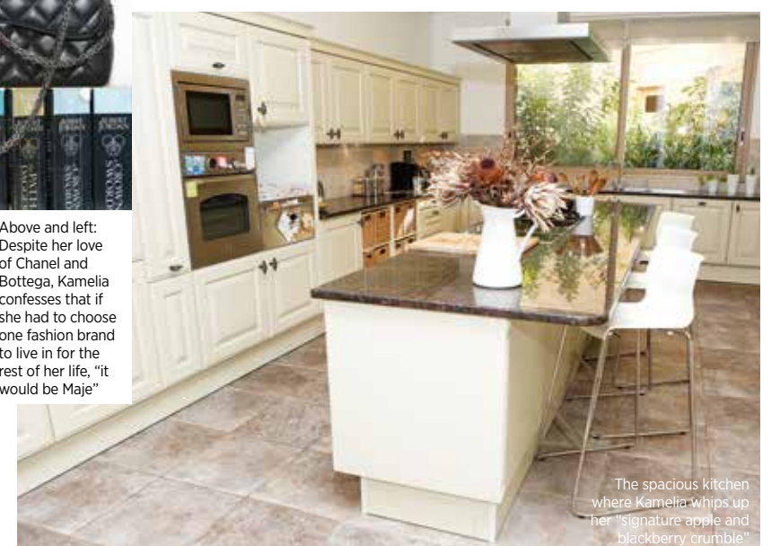
The spacious kitchen where Kamelia whips up her “signature apple and blackberry crumble”